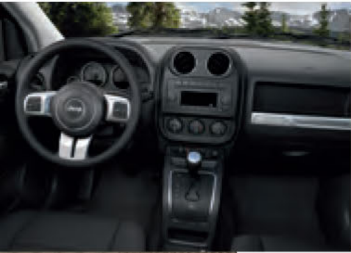
Cloth – Light Pebble