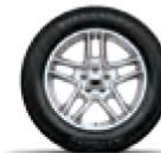
18-inch aluminum Available on Limited Also available in Black through mopar.ca (Shown on front cover)