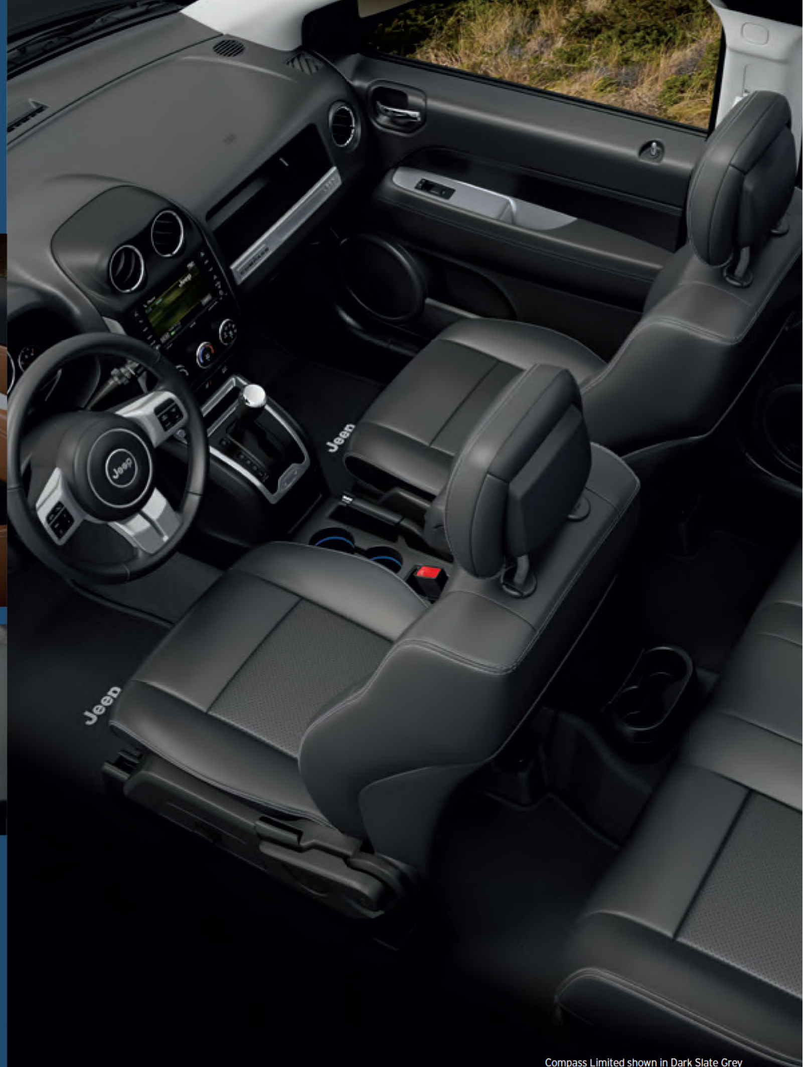
Compass Limited shown in Dark Slate Grey

Compass' interior is designed to achieve the optimal ratio of guests and gear. Rear-seat passengers will appreciate the best-in-class 2 legroom. Everyday necessities easily fit in the cargo space behind the second row. Fold down the two split-folding fold-flat rear seatbacks to reveal a generous 1,515 litres (53.5 cu ft) of cargo space, enough to fit everything needed for a week-long camping trip.