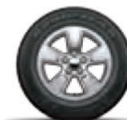
16-inch machine-faced aluminum Standard on Sport with 2.0L