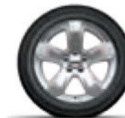
18-inch Chrome-clad aluminum Available on Limited and North Edition with the High Altitude Group*