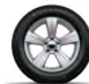
17-inch aluminum Standard on Sport with 2.4L and North Edition, Available on Limited with Freedom Drive II Off-Road Group, Available on Sport with 2.0L