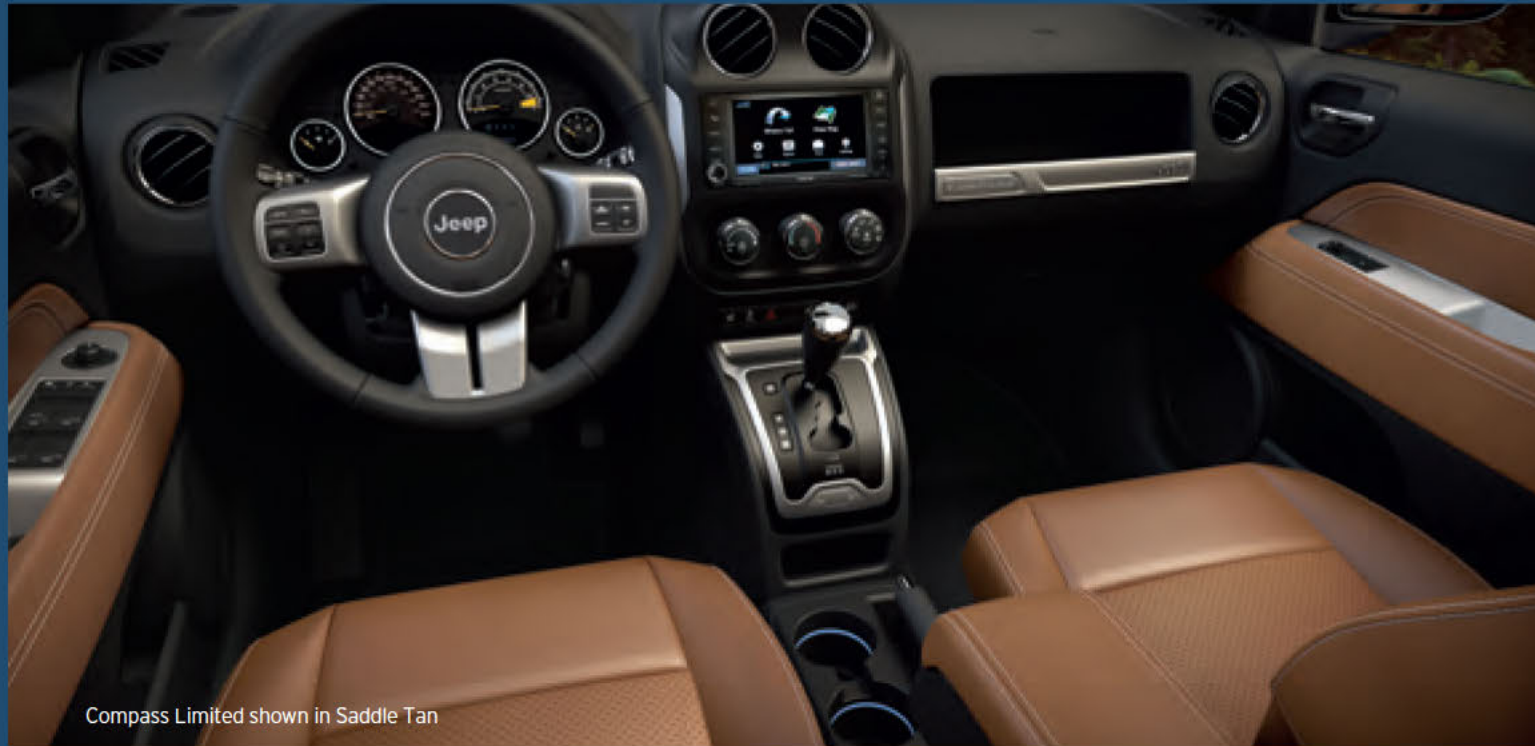
Compass Limited shown in Saddle Tan