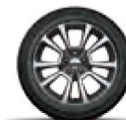
18-inch aluminum with Painted pockets Standard on Limited