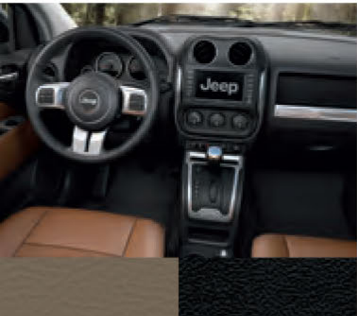
Leather-faced with perforated inserts – Light Pebble†