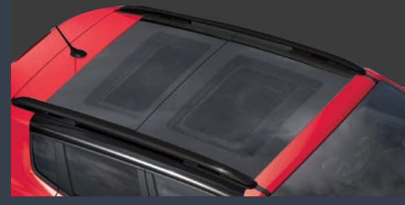
Let just the warmth of the sun shine in when the power sliding glass is closed.

For more fresh air, press a button and the power sliding glass front panel opens.